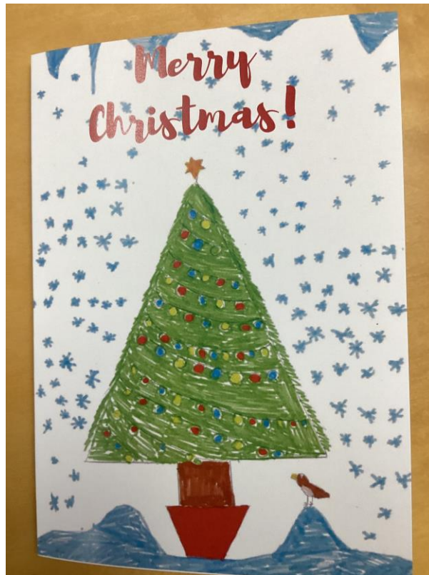
1 - ACER Trust competition winner!

Thank you for being so super to work with and giving your time to support our school.