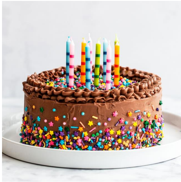
1 - A gentle reminder that children should be in school on their birthdays!

Please note we are not able to authorise term time holidays.